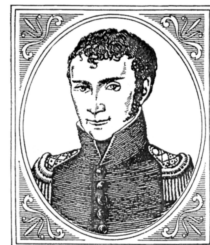
Johann Wilhelm Ritter (1776-1810)