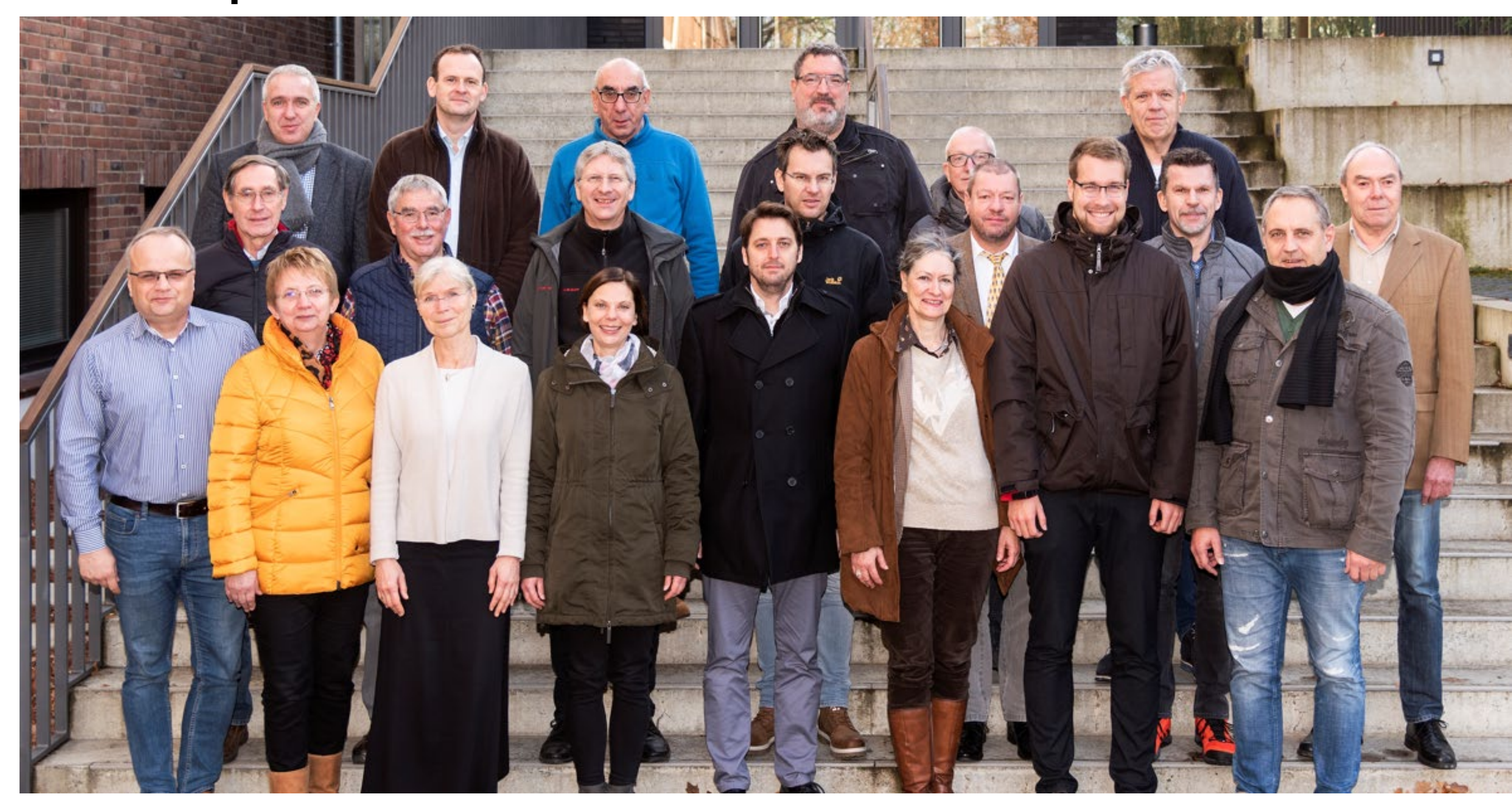
Participants of the 45th AKB-Meeting in Braunschweig (2019)